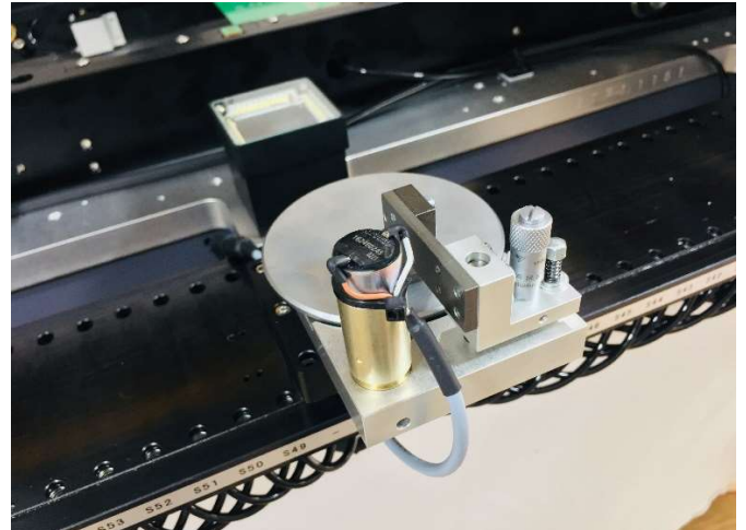
Optional dipping station

SMEMA compatible connectors for synchronisation on input and output side!